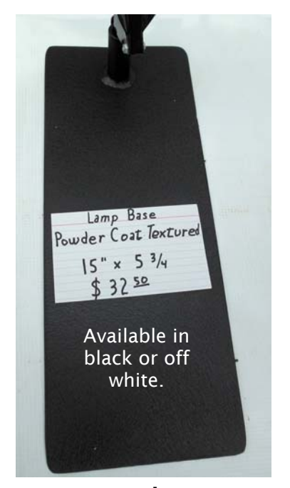
Lamp bases (size approximate) $32.50 each plus postage.

Scott McClaine, (503) 298-3898, PO Box 1294, Astoria, OR 97103