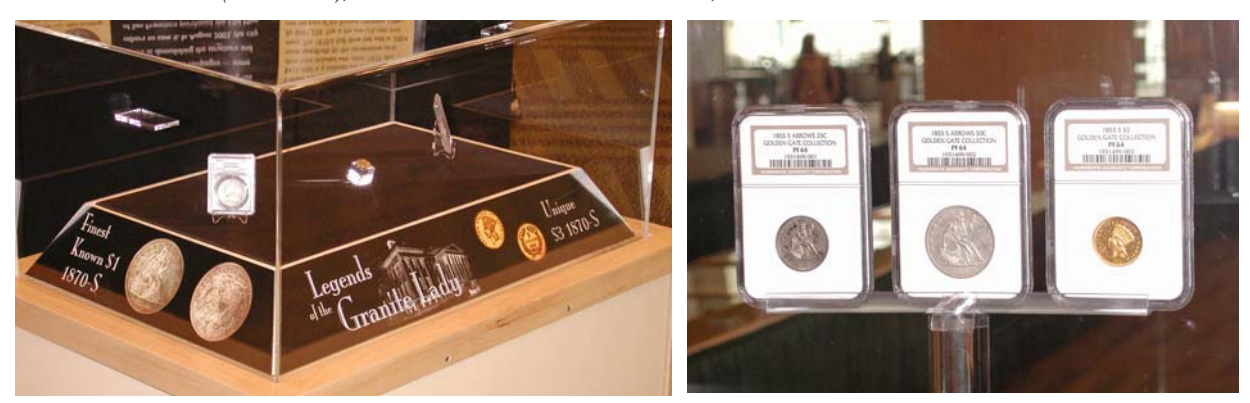
Left - Legends of the Granite Lady exhibit of 1870-S coins including the unique $3 gold piece. Right - Golden Gate Collection 1855-S coins (quarter, half dollar and $3 gold).