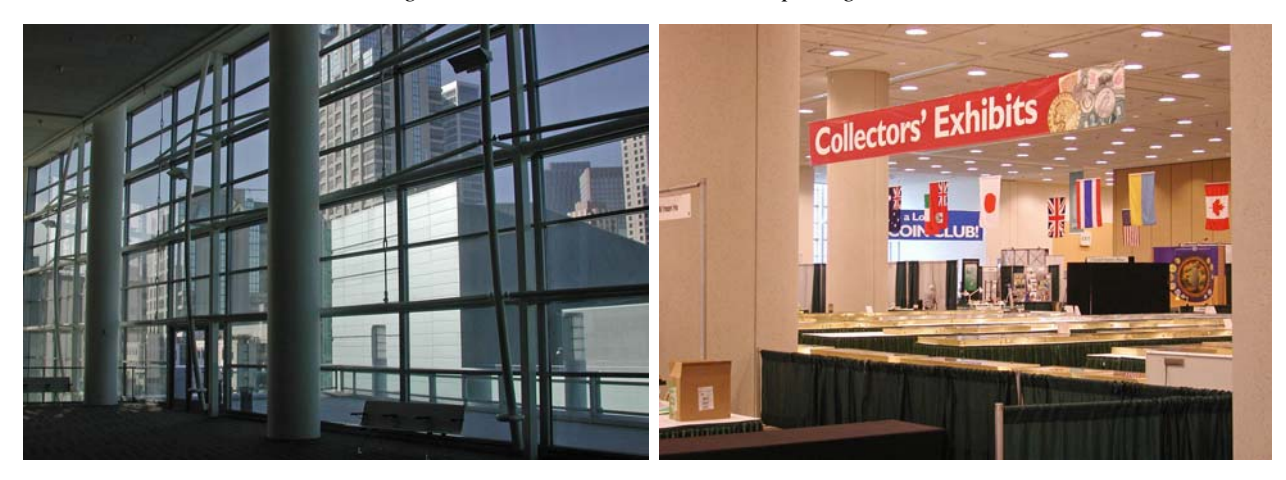
Left - View from the Moscone West Convention Center in San Francisco. Right - View of exhibit area on the 2nd floor. This area contained the collector exhibits, the special featured exhibits (see below), the BEP and various world mints, and the ANA booth.