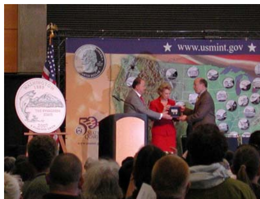
Governor Gregoire receives the first two of the Washington State Quarters struck at the Denver Mint.

The Washington State Quarter was officially launched at a ceremony with Governor Chris Gregoire at Seattle Center on April 11. The quarters then began slowly appearing in circulation, but they probably didn’t last long at your local bank! U.S. Mint Director Edmund C. Moy hosted an interesting numismatic forum following the launch ceremony.