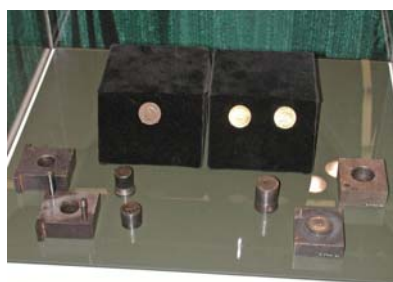
Oregon Historical Society marquee exhibit of the “Portland Penny” and the gold “Beaver” coins and dies.