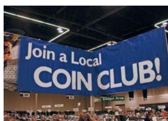
View of the host club table with the bourse floor in the background. The host table was busy during the show, and a number of new club members were recruited with introductory free membership offers.