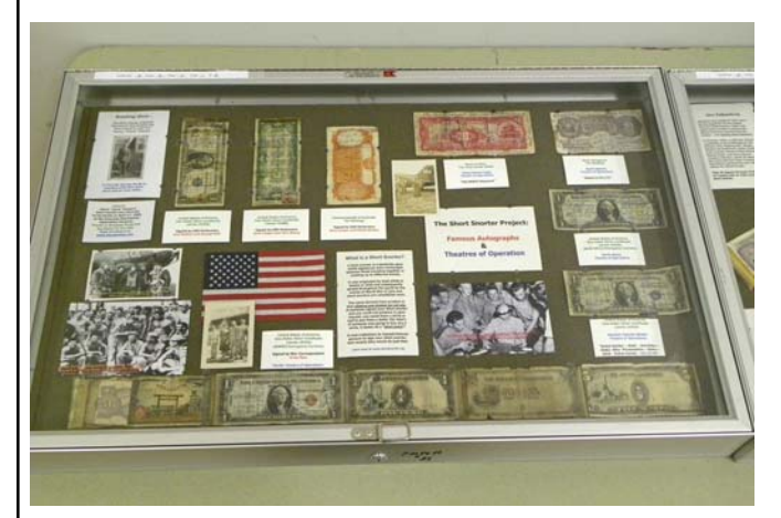
Tom Sparks won "Best of Show" for his four-case exhibit on "The Short Snorter Project."

Attendees at the Colonial Coin Collectors Club (C4) meeting gather round the table to study some colonial paper money.